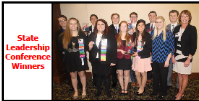
State Leadership Conference Winners