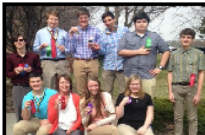
Wayne State Business Day Winners